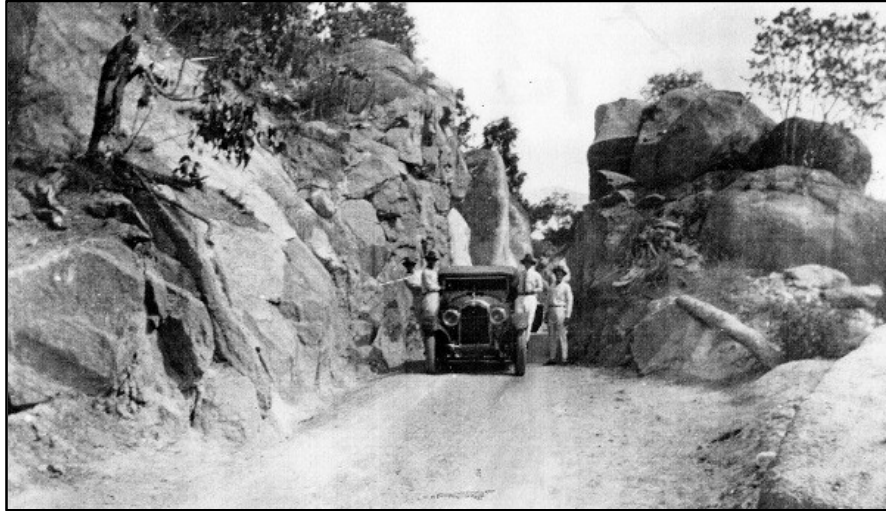
Travelling one way up the Gillies – Date Unknown