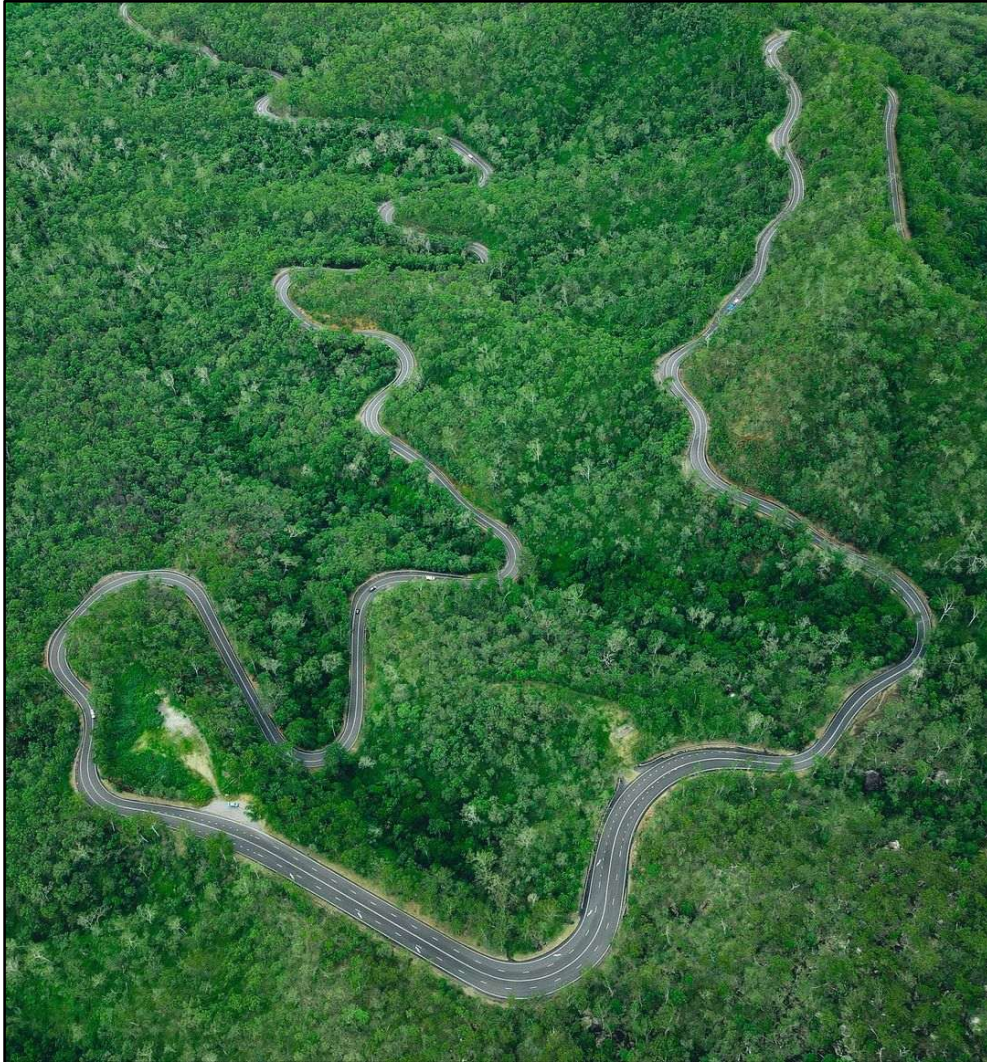
Gillies Range Road Today

“An ear popping 19km journey to the Atherton Tablelands”