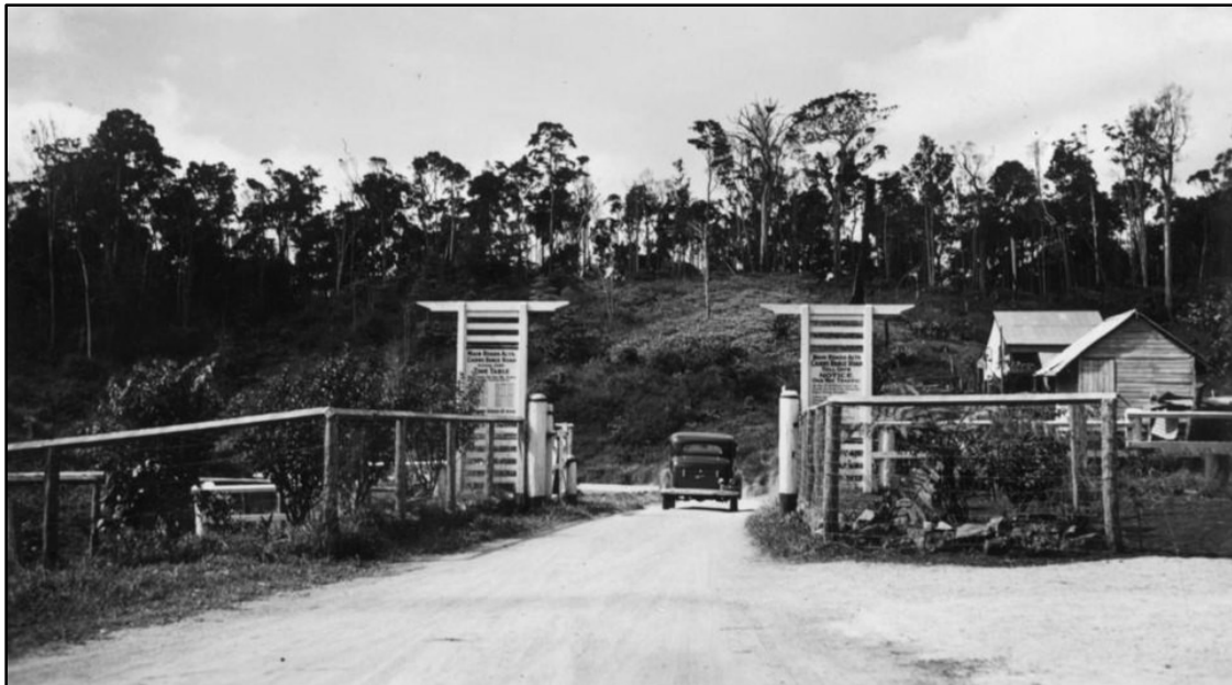
Top gate entering Gillies Highway North Queensland outside Cairns circa 1935

the day according to a timetable. Drivers and vehicles wishing to travel in the other direction were held at the Top Gate or Bottom Gate.