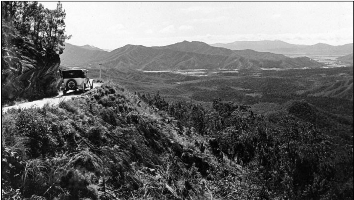
View from Heales Lookout at 2,000 feet (610 m) on the Gillies Highway, circa 1935

2026 is a significant year in Far North Queensland in that it is also the 150th anniversary of the founding of Cairns, with this now designated highway being the first to provide everyday vehicle access to the Atherton Tablelands.