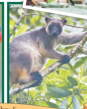
All year round Barramundi Fishing ~ Birdwatchers Paradise ~ Abundant Wildlife