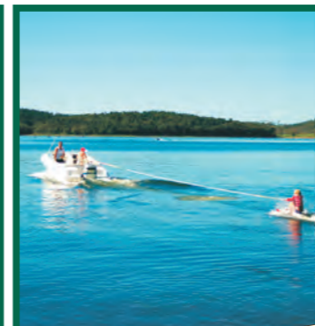
Spot Platypus from the main street Water Skiing.....