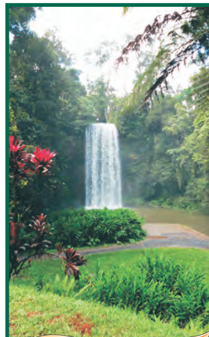
Millaa Millaa Falls